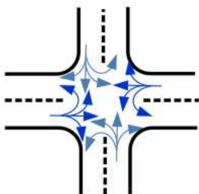
Figure 3. Measurement in all maneuvering directions allowed on each side of the intersection and road intersection

Type 3 - Measurement in all maneuvering directions allowed on each side of the intersection and road intersection (right turn, left turn, right direction, turn) (Figure 3).