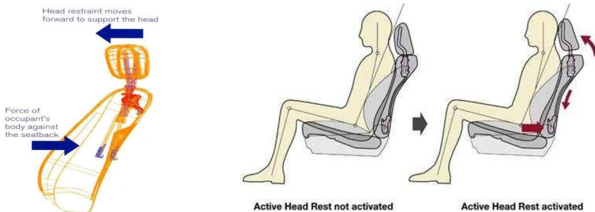
Figure 3 Working of Active Head Rest System

Thereby helping to reduce the impact to the neck of a front seat occupant as shown in figure 7. The mechanism of whiplash injuries closely involves two factors resulting from the impact: the force acting to bend the neck backward and the force that causes the head to tilt rearward. Because the active restraint is effective in controlling these two factors it can help reduce the load on the neck at the moment of the collision. Nission has performed test on the same and reported that there is 45% reduction in force acting to bend the neck. (Hikmat F Mahmood and Bahig B Fileta 2013). Some researchers worked on inflatable head rest (Dante Bigi, Alexander Heilig, TRW Occupant Restraint Systems, Germany, Hermann Steffan, Arno Eichberger 1998) and reported that it is a promising new concept that can reduce Whiplash Associated Disorders (WAD) following rear-end impacts especially in low speed collisions. It allows a comfortable head rest position and is suitable for almost all occupant sizes without the need for adjustment. Presently BMW vehicles, headrest is actuated by pressurized gas while on Mercedes Benz vehicles, it is done by springs. According to various studies, employing the Active Headrest has significantly reduced the severity of neck injuries in rear end collisions and hence it is gaining rapid popularity.