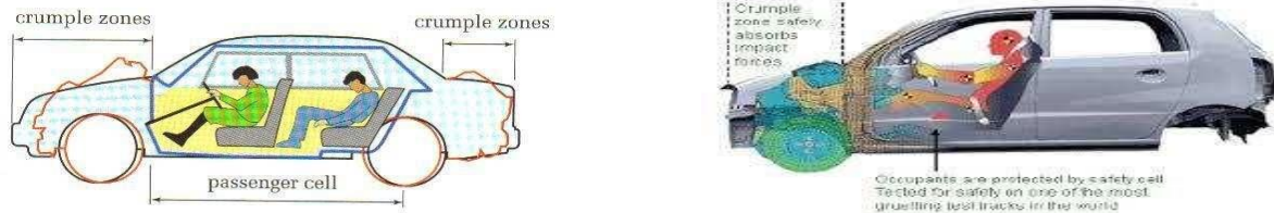
Figure 1 Crumple zone position

experienced by the automobile (and its occupants) is decreased. Conversely too if the time to stop is shorter the force experienced is greater.